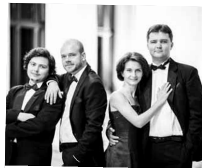
Arcadia String Quartet

Seeking to promote the grand string quartet tradition, the MISQA presents eight concerts and ten masterclasses from August 10- to 23. Performances include the Keller String Quartet at the opening concert, and the Arcadia String Quartet at the closing one. Other participating string quartets include Calidore, Excelsa, Jubilee, and Mucha (14, 15, 21, and 22 at 7 pm). Three young-and-upcoming quartets,