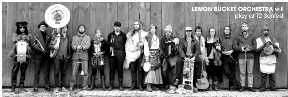
LEMON BUCKET ORCHESTRA will play at TD Sunfest

This year, Canada's longest-running arts festival includes over 85 public events, including 30 free all-ages events. Fans of contemporary