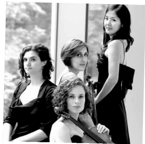
Cecilia String Quartet