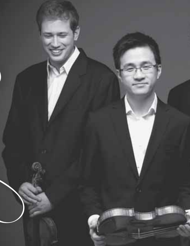
Sunday, July 20, 2014, 7 pm NEW ORFORD STRING QUARTET

“Hailed for their ‘ravishingly beautiful tone’ and ‘extraordinary technical skills and musicianship’ the New Orford String Quartet* are revolutionizing the concept of string quartet playing.”